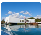
World War II Valor in the Pacific

1 Arizona Memorial Place, Honolulu +1 877 444 6777