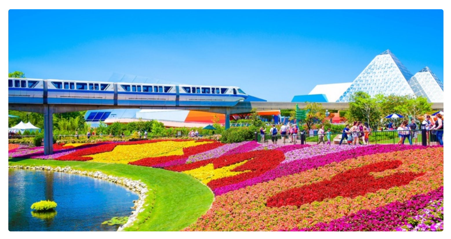
Three Perfect Days in Orlando - A Journey Connected Travel Guide

954.603.3059 journeys@journeyconnected.com https://www.journeyconnected.com